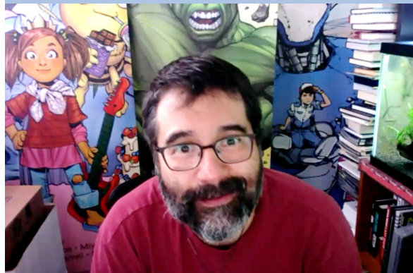
COMIC BOOK WRITER/Greg Pak